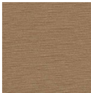
/16 WILD HONEY