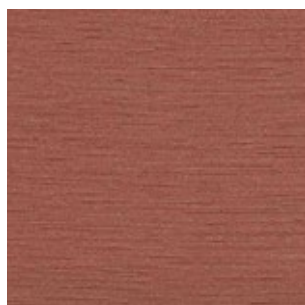
/54 RED EARTH