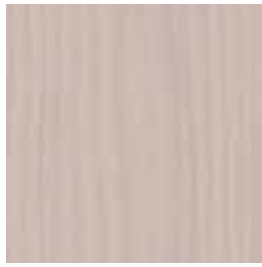
HEMLOCK White Wash