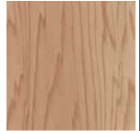
WESTERN RED CEDAR Clear* (3 common shades)