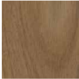
SPOTTED GUM Clear*