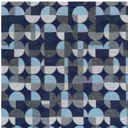
/40 BLUE NOTES